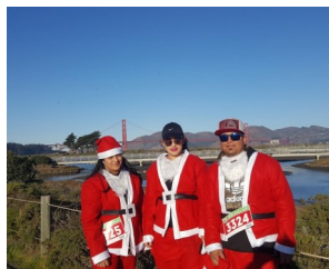
The Great Santa Run in San Francisco 2017!

Escuela Popular Wishes You Happy Holidays from Our Family to Yours!